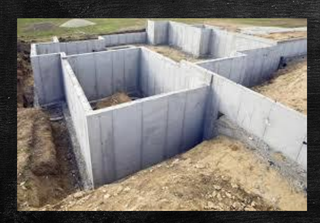
Protect Your Foundation