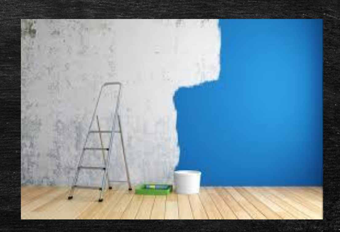
Shore up Your Walls

Protect What You'll Need Most For Your Business To Remain Strong, Adapt, and Keep Running